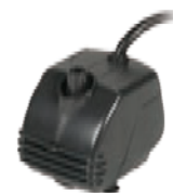
210 GPH Statuary Pump