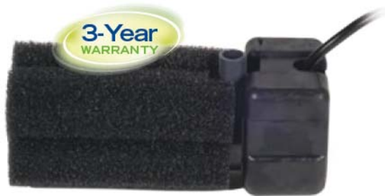
350 GPH Ultra™ Pump